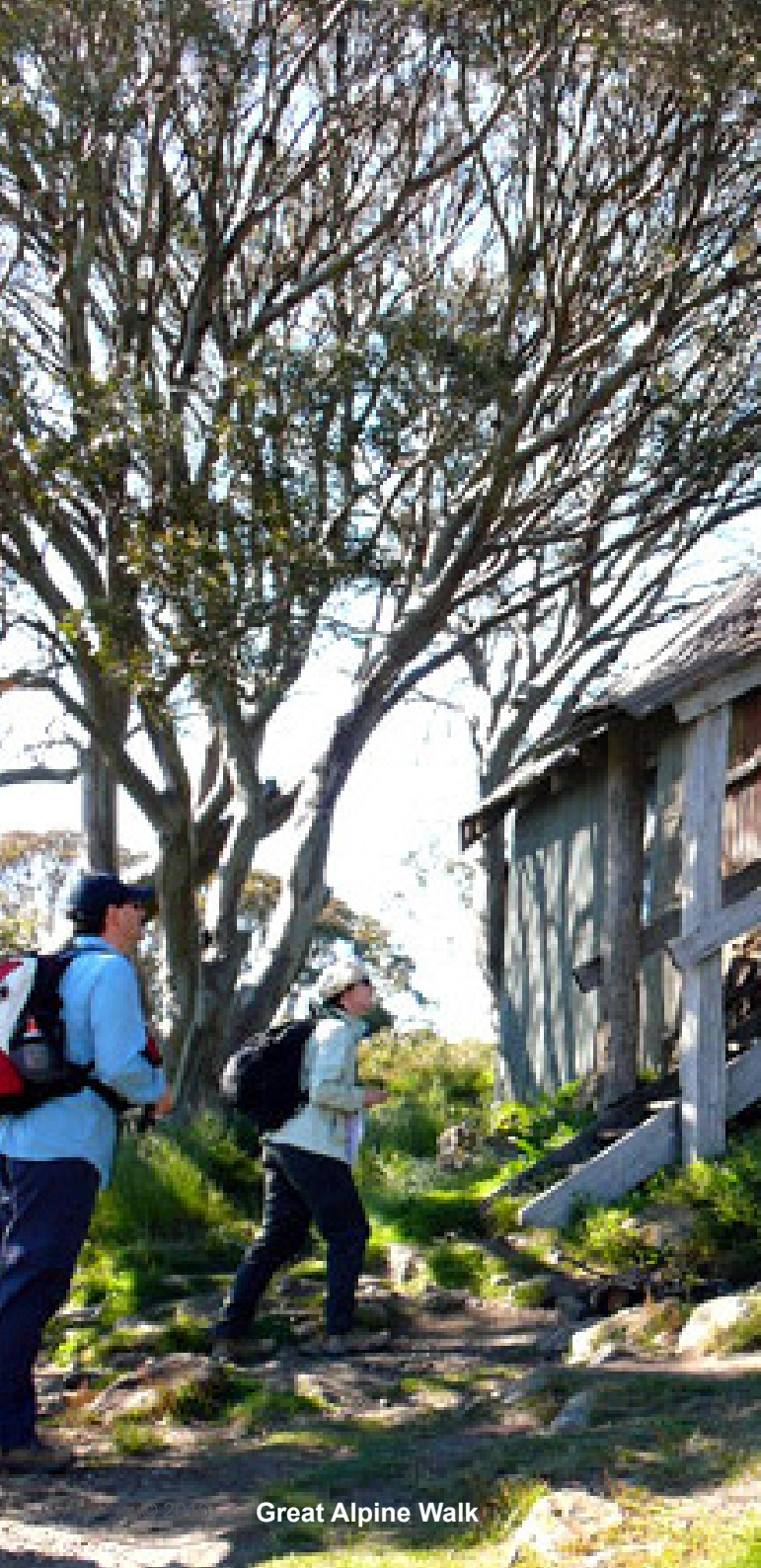
Great Alpine Walk